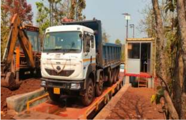
Photo-4 Trucks carrying ore from mines covered with Tarpaulin