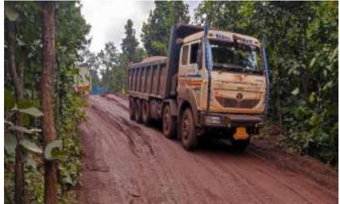
Photo-5 Proposed Parking Plaza lay out and Location inside ML area