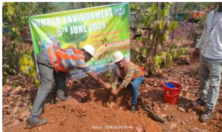
Photo-12 Sapling distribution and Plantation activities carried out inside & outside Mine lease area