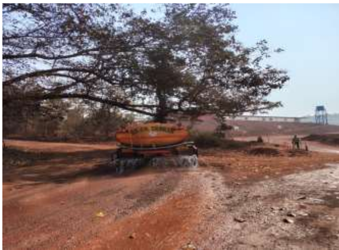
Photo-6 Water sprinkling through mobile tanker on mineral transport road adjacent to mines lease.